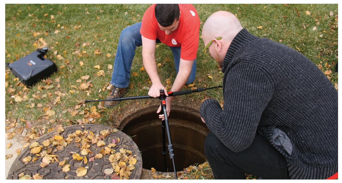
A survey of a manhole may uncover air-quality dangers, which would immediately halt the audit process and leave spaces undocumented. The IVaaS solution includes an assessment of the site, which allows for confined spaces to be evaluated safely, without descent; this "heads-up" approach to surveying means deeper-dive survey activities can be planned with confidence.

its predecessor phase; this modular program design ensures the data collected from each phase carries into the next, culminating in a complete "capture" of the site's telecommunications spaces and pathways, their contents, and associated cable routes.