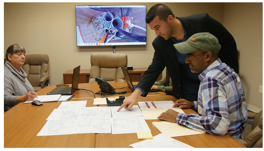
During the preliminary end-user interview, the site's basic information is collected and enduser needs are determined.

standard or another, the infrastructure documentation and management segment has never received the same level of attention, and, as a result, continues to be an issue.