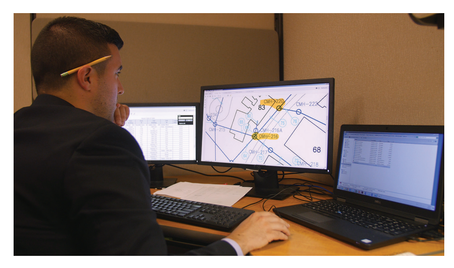
The Ongoing Maintenance phase ensures future moves-adds-changes are recorded and maintained in the infrastructure database throughout the site's lifespan.

The complexity of designing a standardized model required the development of a successful set of processes that break down the complicated and time-consuming survey, documentation, and maintenance activities into individual, defined phases. Each phase is governed by overarching project management principles, and each is designed to be implemented based on the dataset of